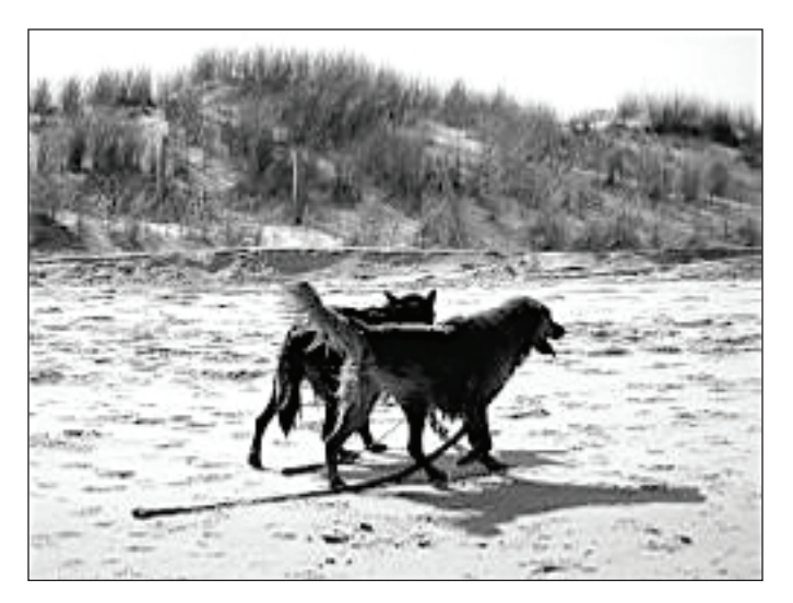
There is always something for an active dog to look forward to at the beach...