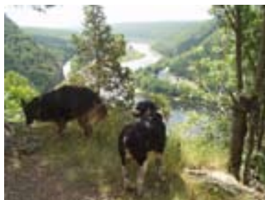
Our dogs will enjoy the views of the Water Gap from the trail.

The Delaware Water Gap, a mile-wide break in the spine of the Appalachian Mountains, is renowned for its depth, width and dramatic beauty. Travelers and settlers have long taken advantage of this breach in the Kittatinny Ridge, caused by a powerful combination of continental drift, ages of mountain building and the relentless action of the river that twists in a tight "S" curve.