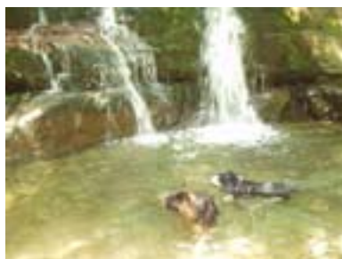
This canine swimming hole in Dunnfield Hollow is a welcome find on the way back from Mt. Tammany.