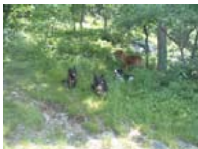
These guys take a well-earned rest at the summit of Mt. Tammany.

We will hike with our dogs to the top of 1,527-foot Mt. Tammany on a rocky, twisting trail. For our effort we will purchase gigantic views across the Gap. Our return will be down the backside of the mountain and through Dunnfield Hollow on an old logging road beside the quick-paced Dunnfield Creek.