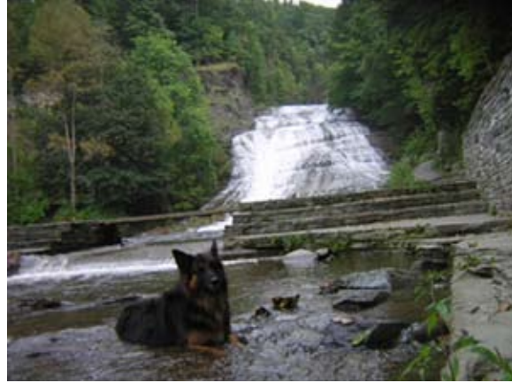
Playing in a plunge pool of a waterfall is standard far in the gap.

We get our choice of five hiking loops here, high above the Delaware River. We'll start on the sporty Tumbling Waters Trail that stretches for three miles past two scenic ponds, through a pine-and-hemlock forest, up the ominously named Killer Hill to reach a switchbacking path down to a series of powerful cataracts that are in a serious hurry to get down that mountain.