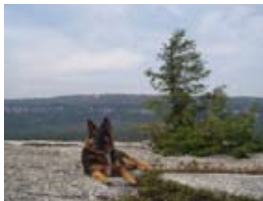
Vistas arrive at regular intervals on canine hikes along the Escarpment Trail.

North-South Lake lies at the eastern edge of the Catskill escarpment where the elevation rises abruptly from 540 feet at its base of the cliffs to 2500 feet. The campground offers easy access to the trail along the escarpment where spectacular views of the Hudson River Valley will be purchased with very little effort on this mostly level canine hike.