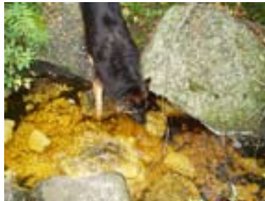
The dark, hemlock-filled gorge filters crystal-clear water below Kaaterskill Falls.

Kaaterskill Falls, a two-tiered water plunge with a slight lefthand turn, is New York's highest waterfall. The upper ribbon of water drops a full 175 feet - the same as Niagara - and the lower falls tumble an additional 75 feet into a rocky basin. Kaaterskill was an inspiration for landscape painter Thomas Cole, founder of the Hudson River School of painters, the first major art movement in the United States. The trail for the dogs is sometimes rugged but is less than one mile and a good introduction to the Catskills.