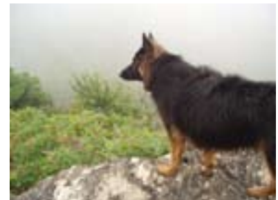
There are dogs-eye views throughout the Catskills.

only want to meet us for one day? one day rate - $69