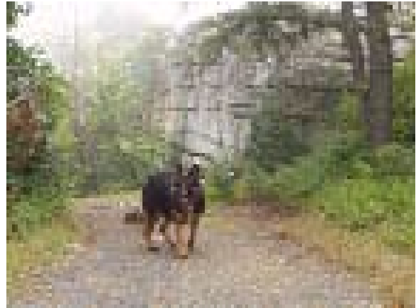
The canine hiking is easy on the beautifully crafted carriageways at Minnewaska State Park Preserve.

The narrow hiker-only paths are where the adventure begins for canine hikers at Minnewaska State Park Preserve and we'll use these to reach some of the treasures tucked deep in the Shawangunks, like Stony Kill Falls.